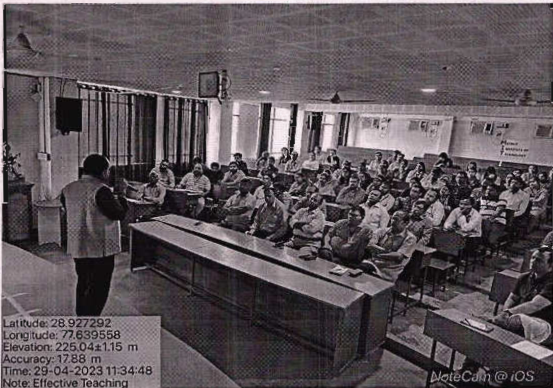
Faculty Development Program on Effective Teaching and High Impact Classroom Skills