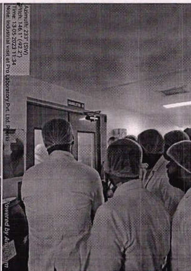
Industrial visit of Bachelor of Pharmacy students to PRO Laboratories Pvt. Ltd., Roorkee on 13 th May, 2023