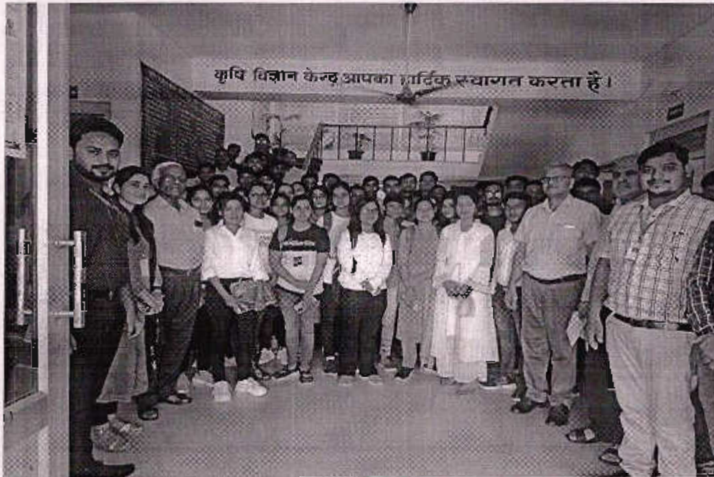
B. Sc. (Agriculture) students visited Krishi Vigyan Kendra Hastinapur on 23/09/2023